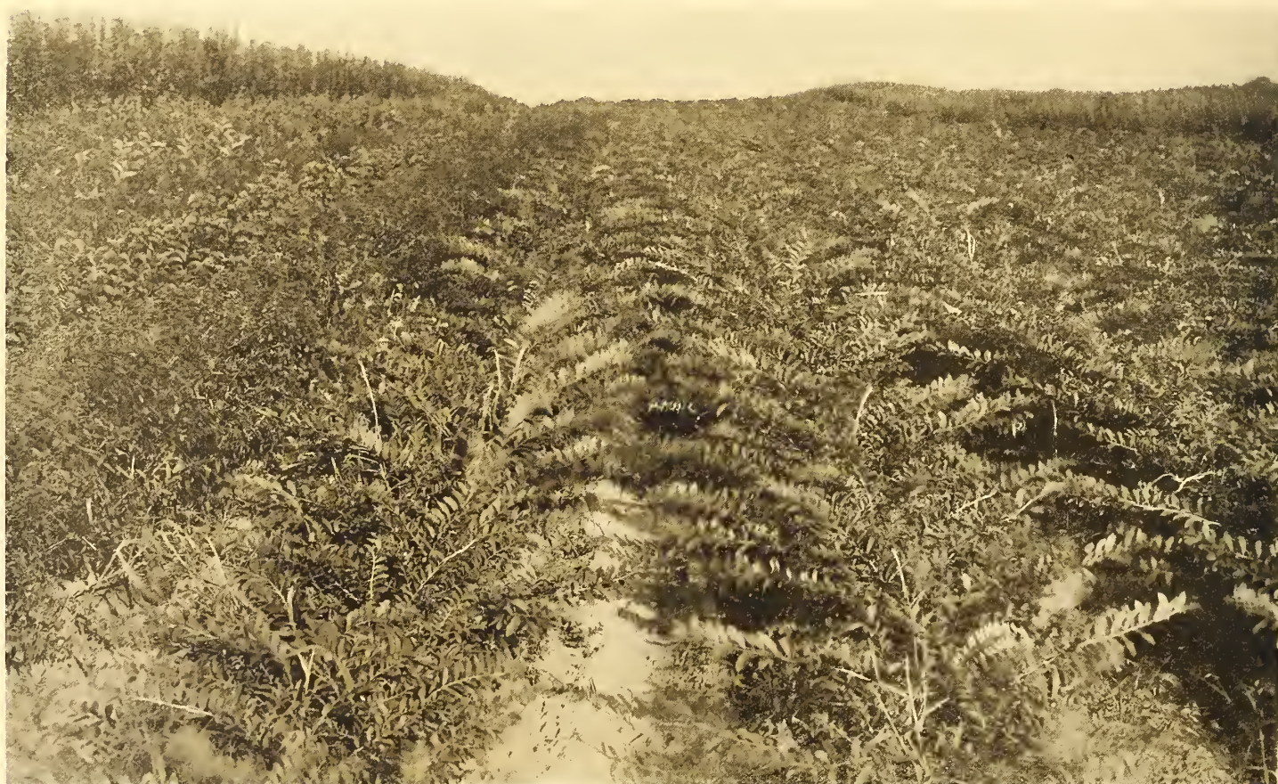
Our Regel's Privet: from cuttings, and a single type, to secure absolute uniformity.